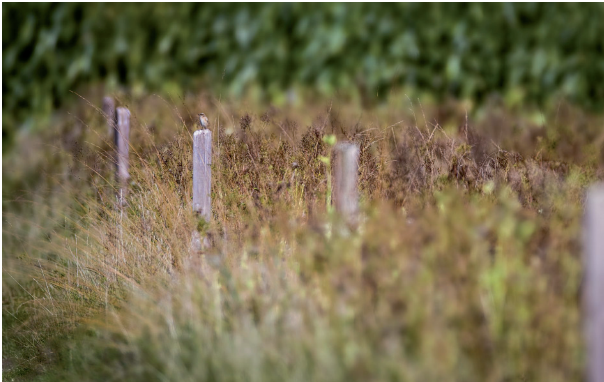
Fig. 3: Whinchat on a fence post in a diverse extensively managed meadow in late summer with sufficient insect supply, Rosswiesen.

be the breeding areas, as well as areas where territories in the past were located. It remains unclear whether the Whinchats wanted to establish a territory in these areas but moved on, e.g. due to disturbances, or whether the areas were suitable only as resting areas, but no longer as breeding habitats, due to changes in the environment. Despite the agricultural intensification that has taken place on the Ennstal meadows in recent decades, the area still provides important resting areas for Whinchats and other migratory birds (BIRDLIFE ÖSTERREICH – LANDESGRUPPE STEIERMARK 2015).