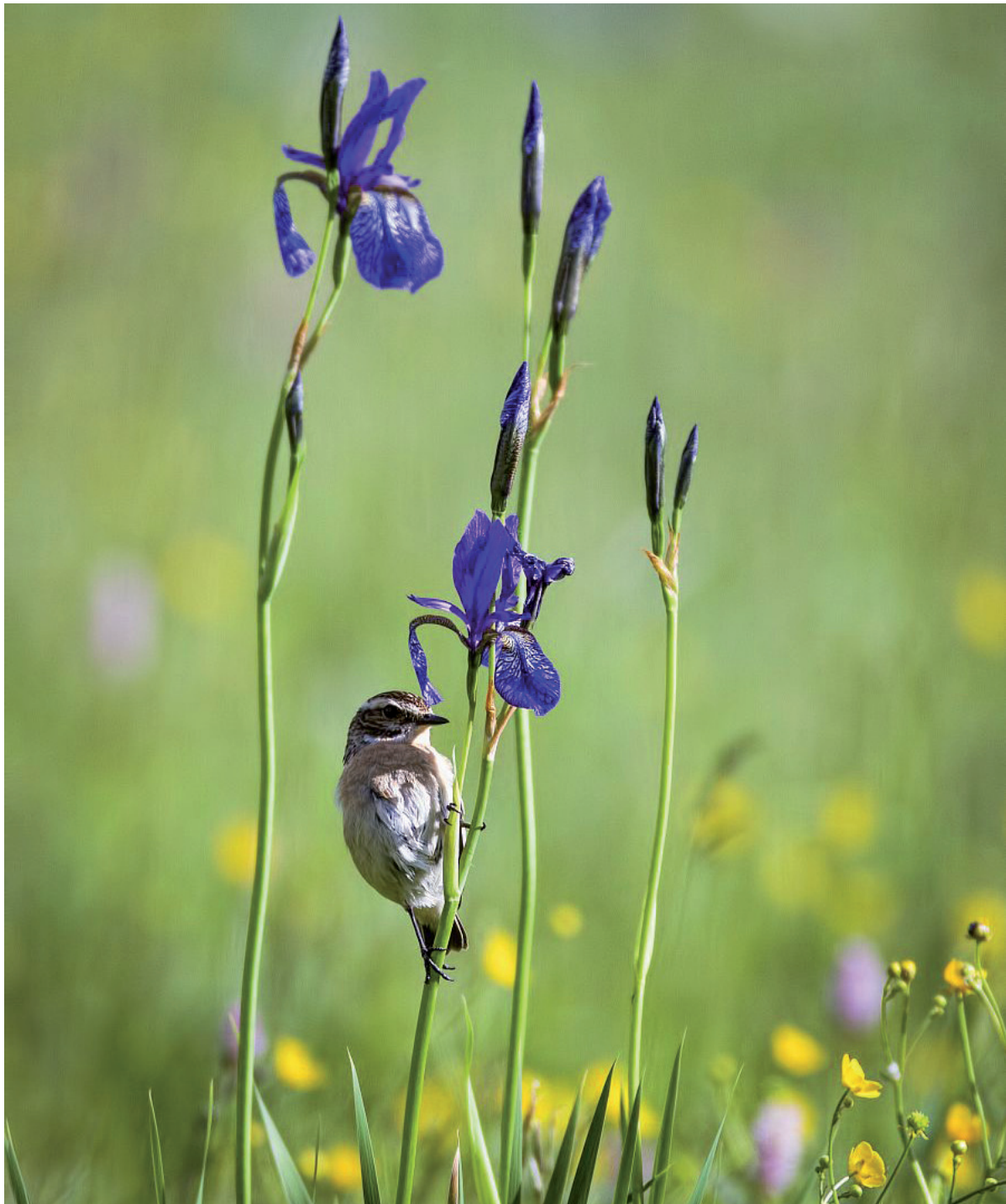
Fig. 4: Whinchat using a characteristic plant in the Ennstal area, a Siberian iris ( Iris sibirica ), as perch.

chat, which prohibits the levelling of dips and ground unevenness (TEUFELBAUER et al 2012). Fertilization prevents the formation of dense vegetation in the herb layer (BASTIAN & BASTIAN 1996). The present study has shown a significant difference in soil flatness and vegetation density between Whinchat territories and control areas, which suggests measures to prohibit soil levelling and fertilization.