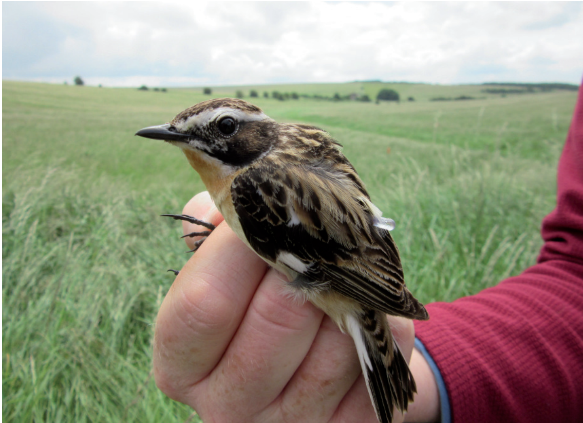
Fig. 1: Male Whinchat tagged with a geolocator in Salisbury Plain.

suggesting that high immigration was probably responsible for buffering against this decline. Elasticity analysis indicated was most sensitive to changes in adult survival but with covariance between demographic rates accounted for, was most sensitive to changes in productivity. Our study demonstrates that high quality breeding habitat can buffer against population decline but high immigration and low productivity will expose even such stronghold populations to potential decline or abandonment if either factor is unsustainable. First-year survival also appeared low, however this result is potentially confounded by high natal dispersal. First-year survival and/or dispersal remains a significant knowledge gap that potentially undermines local solutions aimed at counteracting low productivity.